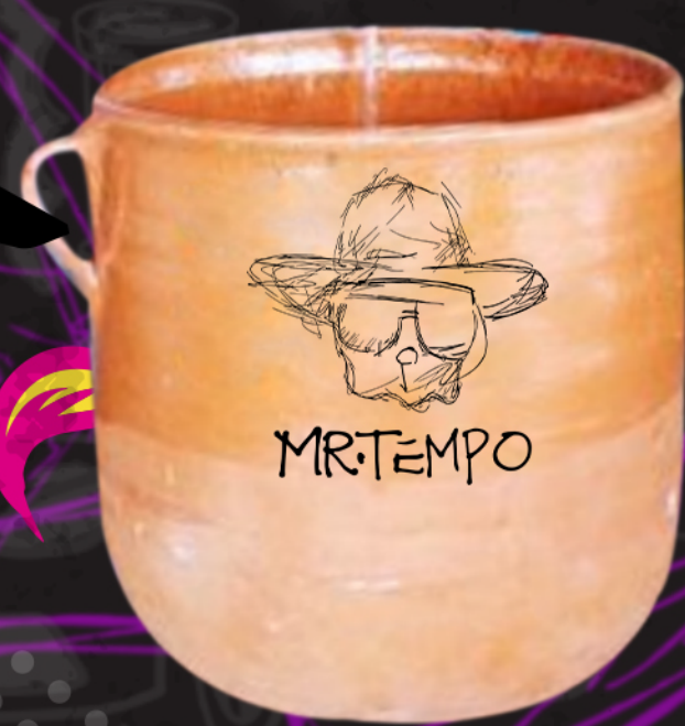
GUADALAJARA TEQUILA SOUVENIR 35