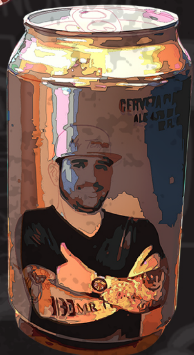
#MASCHINGON MICHE 14 Fresh purées, Squeezed Lime Juice, Homemade Mexican Candy, Topped with Gummies. Your choice of Mr Tempo Lager or Mr. Tempo Clara beer

MR. TEMPO FAVORITES (GF) GLUTEN FREE OPTION AVAILABLE WE KINDLY ASK NOT TO REQUEST MODIFICATIONS (UNLESS OF ANY FOOD ALLERGIES) TO FULLY EXPERIENCE THE FLAVORS OF THE PLATES THAT MR. TEMPO CREATED WITH LOVE