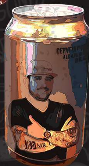
#MASCHINGON MICHE 14

Fresh purées, Squeezed Lime Juice, Homemade Mexican Candy, Topped with Gummies. Your choice of Mr Tempo Lager or Mr. Tempo Clara beer