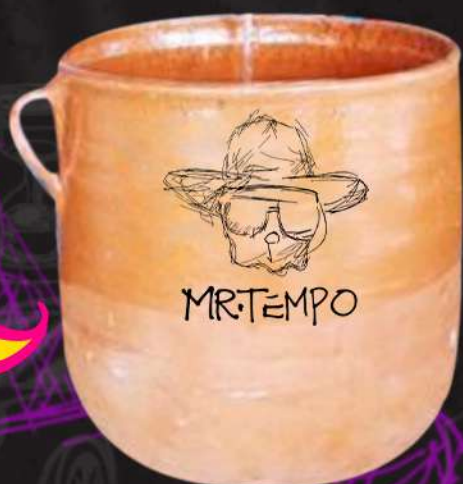
GUADALAJARA TEQUILA SOUVENIR 35